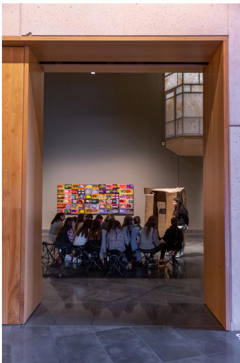
COMPOSICIÓ AMB CISTELLA. 1996 ANTONI TÀPIES

Post-visit: The artworks are explained, questions are answered, and to conclude, the staff thanks the school for their visit.